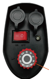
Torque Dial 扭矩刻度盘

Set the Main switch (e) at "OFF", the Trigger lock at "LOCK" and remove the Battery pack. 请关闭电源与扳机开关并卸下电池。